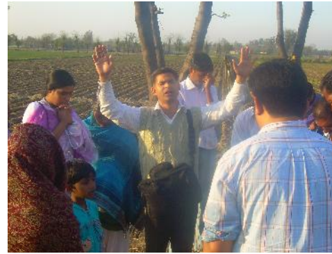
A prayer before rebaptism

souls take their stand for the Message of the hour.