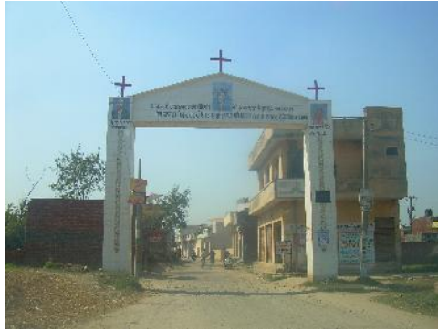
Nandan pur entrance