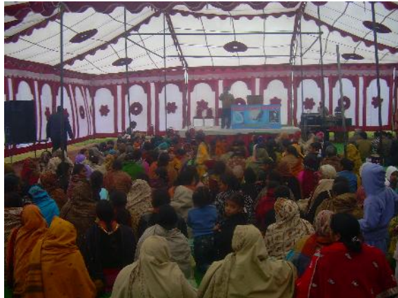
Attendance in Arnoli