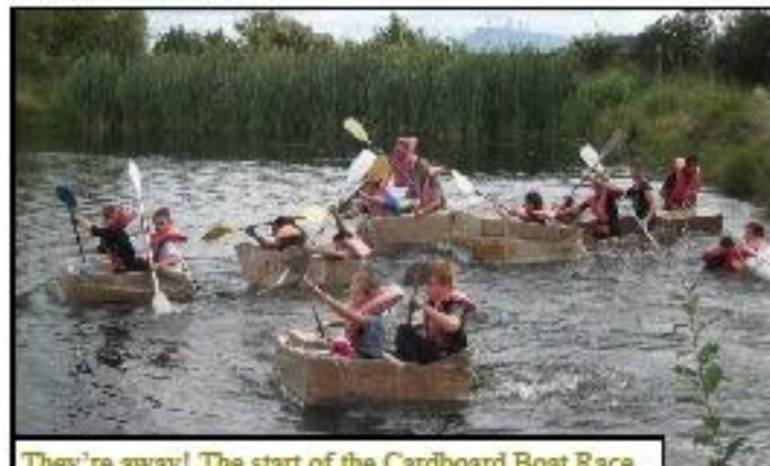
They're away! The start of the Cardboard Boat Race.