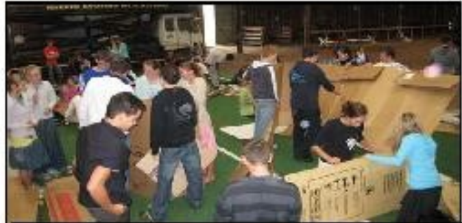
Much thought must go into the building of their boat to make it seaworthy and 'stand the test'

We were also blessed to have 7 young people come from Caboolture, Australia to be with us at camp this year. Thanks to Bro. Grant Bull for his efforts in arranging and escorting them in their travels.