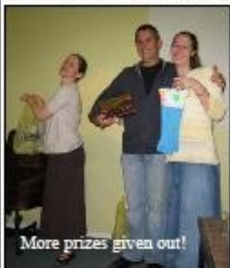
More prizes given out!