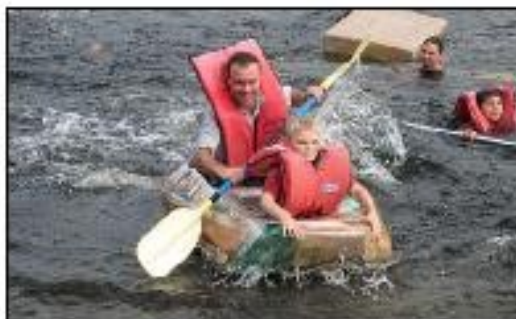
Smiles of victory on the faces. The wake behind the boat, is very impressive.

There was horse riding for the girls and abseiling for the boys, a giant swing with a modesty adaptation for the girls. While the boys played penguin soccer in the equestrian centre, the girls relaxed in the hot pool. Egg tag was compulsory and caused a lot of laughter and a lot of begging for spare eggs to "repay" Brother Eugene. Cardboard boat building continued for two days. While the boats weren't as novel in their decoration they were more sea worthy than last year.