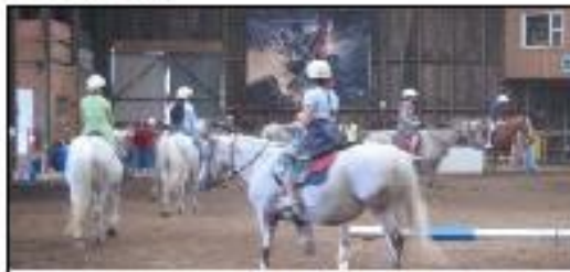
The Girls are settling their horses prior to trek

Between services there were various activities.