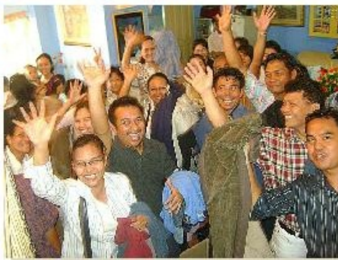
(above The Philippine saints, 'Thank you Jesus!')