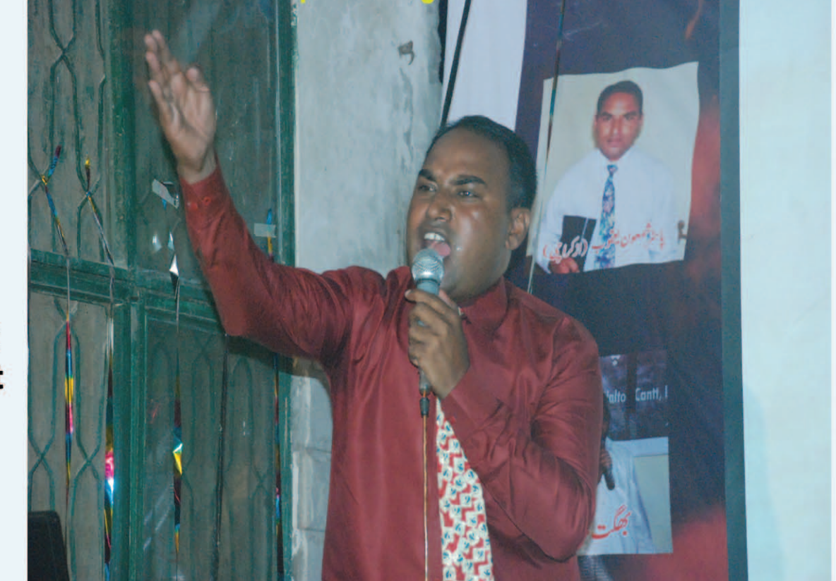
Sunday meeting 20th May 2012 :

In Sunday morning service those Bishop and some Pastors and their families came to church to listen the message of hour again.