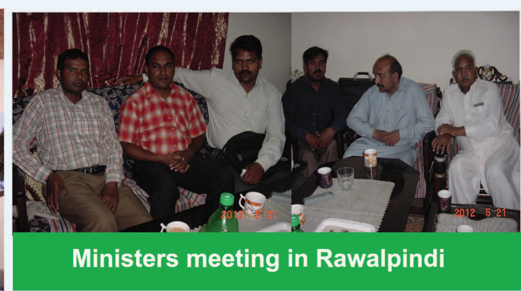
Ministers meeting in Rawalpindi