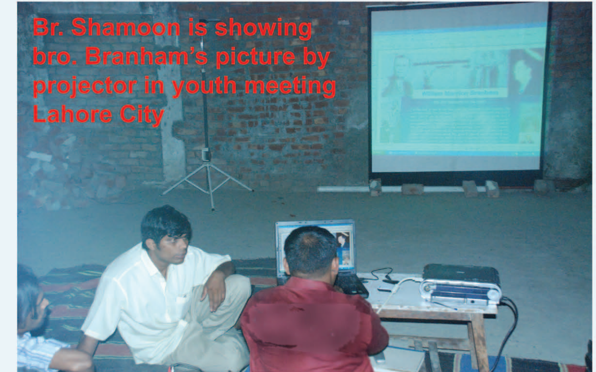
Youth Meeting in Lahore 19th May 2012:

Jesus Christ as Saviour and Lord and this message of the hour. Praise and glory to Lord Jesus Christ