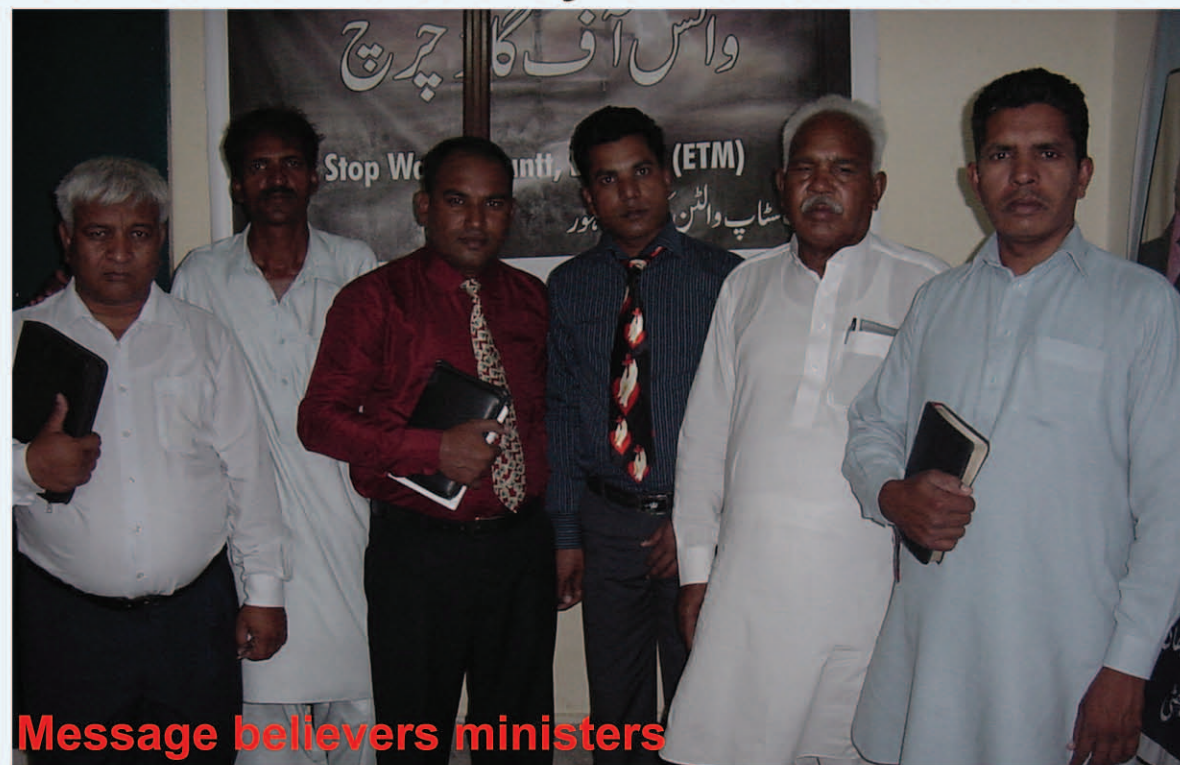
Message believers ministers

By the grace of God we are reaching the new areas all around the Pakistan with the end time message by His grace to His elected sons and daughters. Praise and glory to God and we are greatly and highly thankful and appreciated to Lord Jesus Christ for His amazing and wonderful grace that He is using us in this extremist Islamic country of Pakistan to reach the