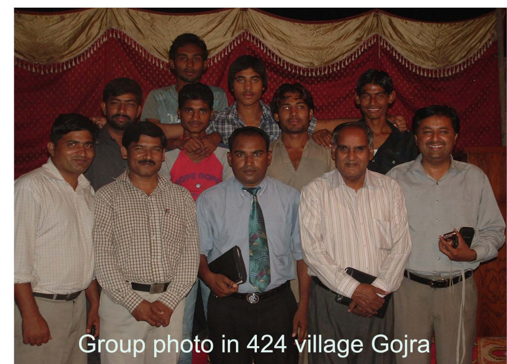
Group photo in 424 village Gojra