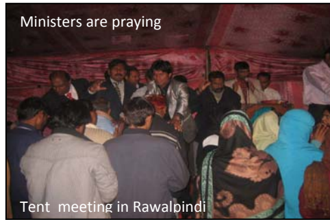
Ministers are praying