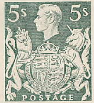
4. THE LION—the symbol of Great Britain.

CERTAINLY IT IS more than coincidence that THESE FOUR SYMBOLS TODAY ARE THE SYMBOLS OF THE FOUR GREAT WORLD POWERS! Are not these another sign pointing to the fact that the end of the age is at hand?