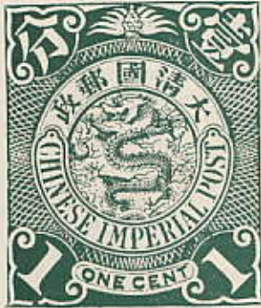
1. THE DRAGON is the symbol of CHINA.