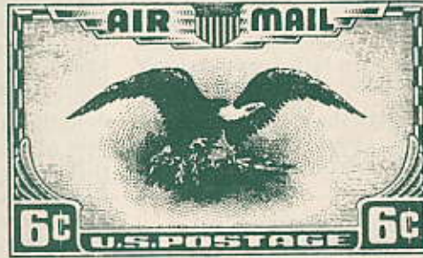
2. THE EAGLE—the symbol of America.